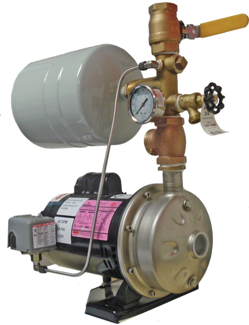
.75 - 3 HP